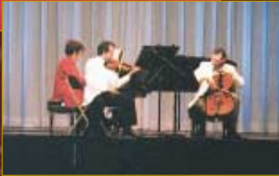
Kennedy Center, Washington, DC