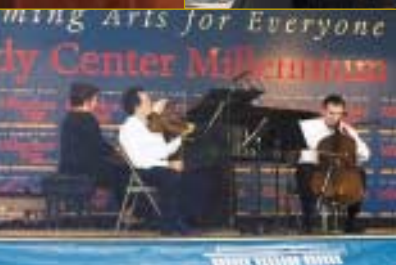
Capitol Series, Washington, DC